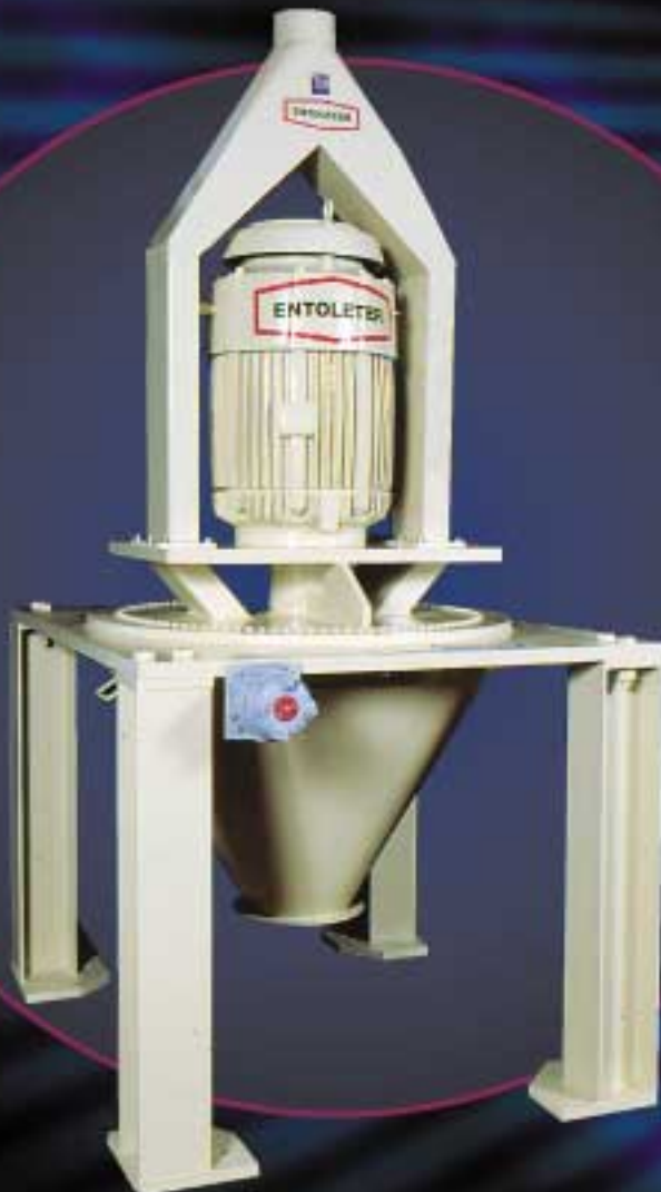
SERIES 40 Direct Drive

The Entoleter CentriMix is easy to install in an existing system, requires a minimum of floor space (it can be ceiling mounted), and is entirely self contained. All models of the Entoleter CentriMix can be adapted for open processing or dust-free closed systems.